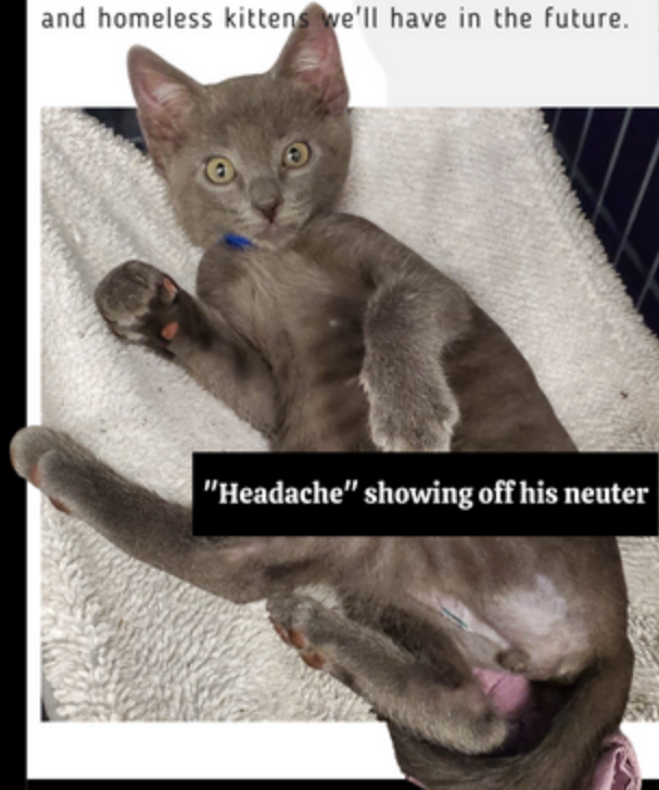
"Headache" showing off his neuter

You might be thinking, "Wouldn't it be easier if we had a low-cost clinic right here in Santa Rosa County?" We think so, too! So, we're building one. Learn more about the project and find out how you can help make this dream a reality at www.ahope4src.com/cliniccomingsoon .