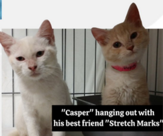
"Casper" hanging out with his best friend "Stretch Marks"

Their foster mom says they loooooove cuddling together. When Stretch Marks came back from the vet after getting fixed, Casper gave her a full-body bath to welcome her home and help her feel (and smell) better.