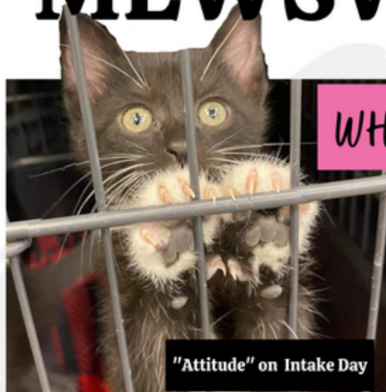
"Attitude" on Intake Day