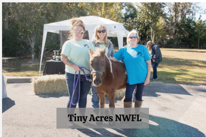
Tiny Acres NWFL