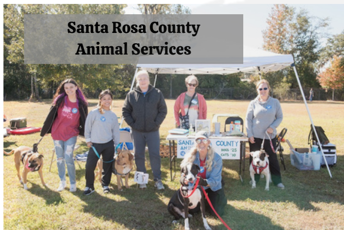
Santa Rosa County Animal Services