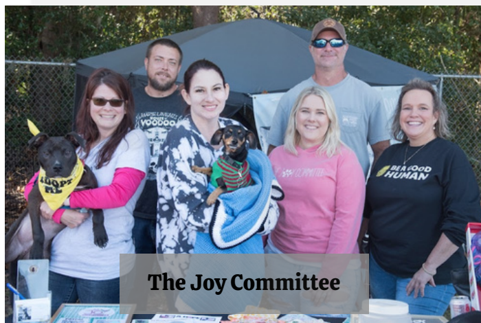
The Joy Committee