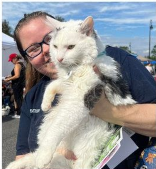
A New Lease On Love 2023