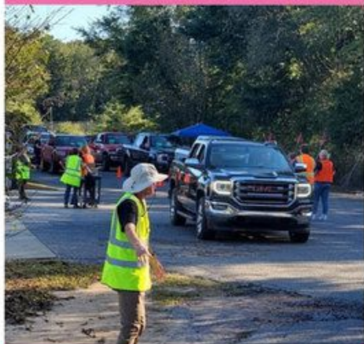
SRCAS Rabies Clinic Drive-Through